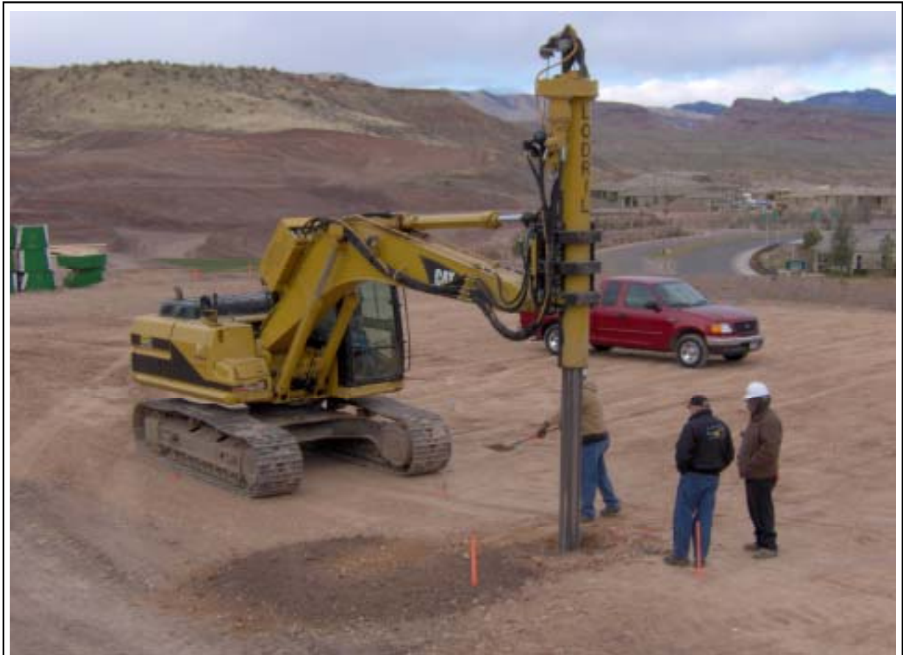
DH10-15m in St. George, Utah with 610 mm auger